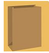
Place outer side of the mask face down on a paper towel or place in a paper bag