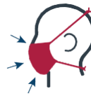
Secure the mask to your head. Make sure it fits snugly, covers the bridge of your nose, and stretches under your chin