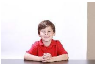
Stay seated while eating or during mask break